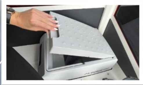
Dometic 15 ltr. fridge